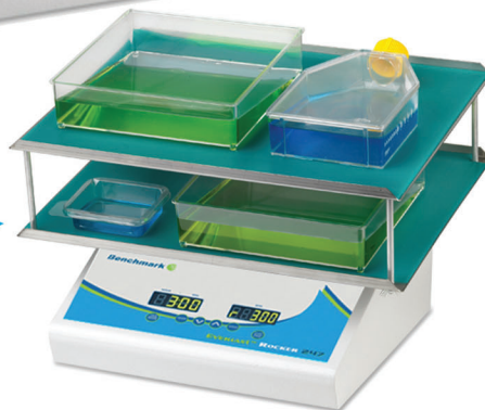
Model BR5000 shown with BR5000-STACK

Extra large platform, 16x12 in. (40 x 33 cm)